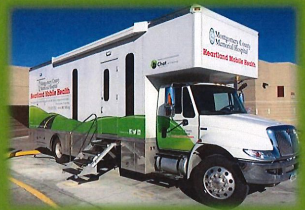
Mobile Primary Care Unit! Taking primary care to every community we serve.